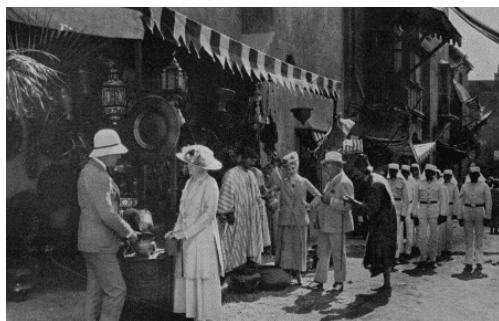
A SCENE FROM THE PHOTOPLAY—BURNING SANDS

“Your father trusted me,” Daniel replied, and held out his hand.