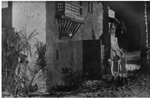
A SCENE FROM THE PHOTOPLAY—BURNING SANDS

Muriel lay upon the slope, her hands behind her head; and Daniel, sitting beside her, and looking down at her with his calm blue eyes, had the sunset as his aureola, so that he put her in mind of some figure by Bonozzo Gozzoli painted against gold. His massive head and shoulders seemed to tower above her like those of a rugged presence rising out of the rocks and sand of the wilderness; and she noticed for the first time that his face was reminiscent of Watts' "Samson," a picture which had always delighted her.