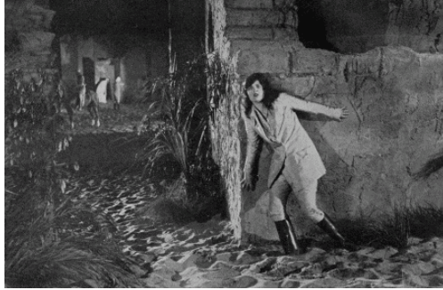
A SCENE FROM THE PHOTOPLAY—BURNING SANDS

He pushed her back into the house and returned to Muriel.