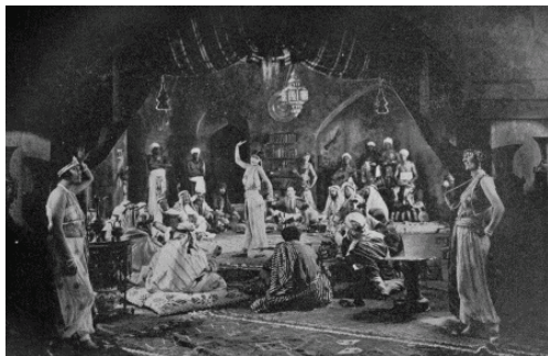
A SCENE FROM THE PHOTOPLAY—BURNING SANDS

her dark hair which fell about her shoulders.