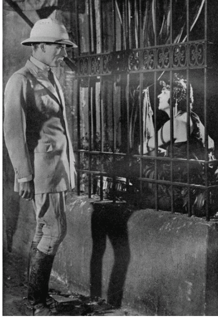
A SCENE FROM THE PHOTOPLAY— BURNING SANDS

He did not answer. "I'll go and get the camels," he said. "Ever ridden a camel?"