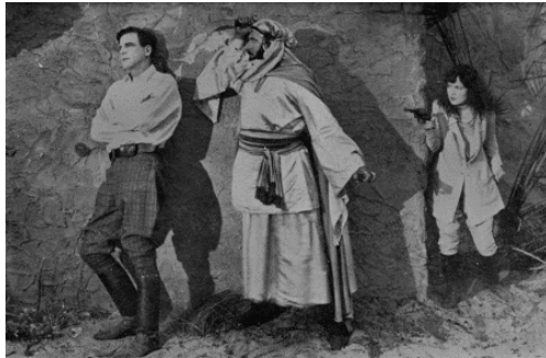
A SCENE FROM THE PHOTOPLAY—BURNING SANDS